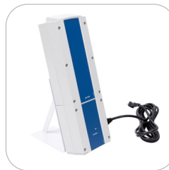
Optional Charging Base