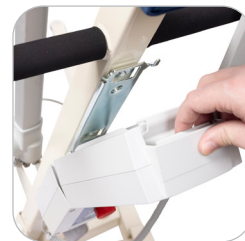
Quick Release Battery