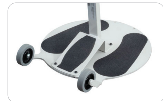
ANTI-SLIP BASE Prevents movement during transfer