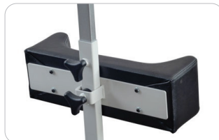
Height Adjustable Padded Knee Pad