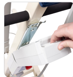
Quick Release Battery