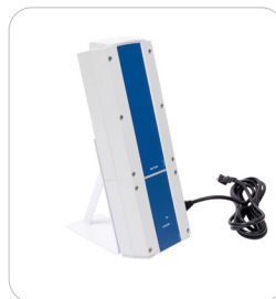
Optional Charging Base