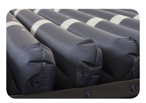
EZ SNAP-IN-SNAP-OUT REPLACABLE CELLS